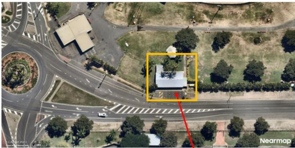
Crowley Horticultural Pavilion

Park on Exhibition Road and enter the Crowley Horticultural Pavilion using the external door.