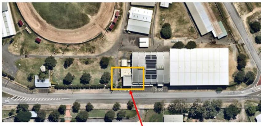
Robert Schwarten Pavilion Pick up location

Park on New Exhibition Road and walk into the Robert Schwarten Pavilion via the foyer doors.