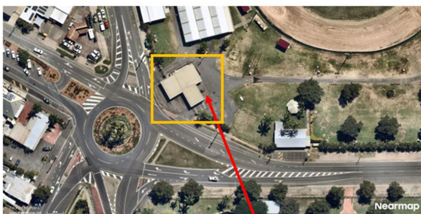
Rockhampton Showgrounds Administration Office Drop off location

All exhibits must be delivered to the Showgrounds on the specified delivery date/s. No exhibits delivered outside the specified date/s will be accepted.