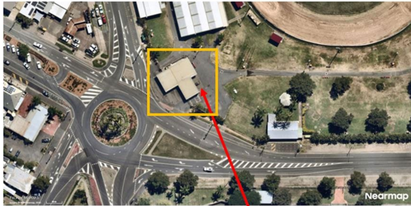
Rockhampton Showgrounds Administration Office Drop off location

Park on New Exhibition Road and walk into the Robert Schwarten Pavilion via the foyer doors.