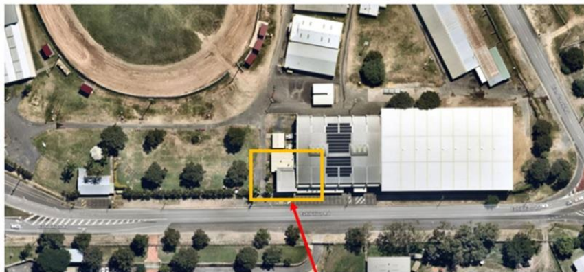
Robert Schwarten Pavilion Pick up location

All exhibits must be delivered to the Showgrounds on the specified delivery date/s. No exhibits delivered outside the specified date/s will be accepted.