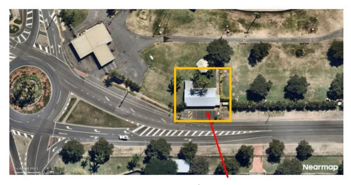
Crowley Horticultural Pavilion

Park on Exhibition Road and enter the Crowley Horticultural Pavilion using the external door.