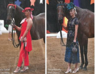
92 Horse Deals SINCE 2016